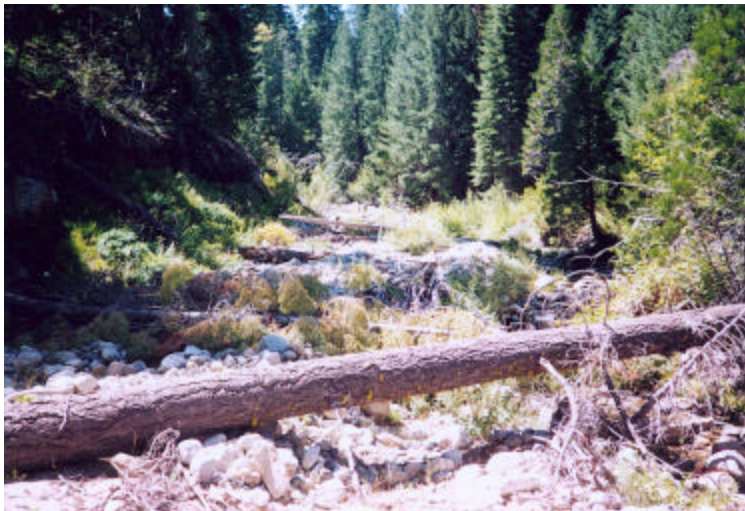
Upstream end (apex) of the Boulder Creek alluvial fan.

entire fan may continue to grow with time, but stream downcutting may cause fan incision. Eventually the entire fan is dissected as the incision reaches the apex of the fan and captures the trunk stream as it emerges from the mountain (Ritter 1995). Additionally, alluvial fans disperse water flows that pass over and through them, helping to recharge local groundwater aquifers. When the trunk stream is captured, this process is greatly diminished.