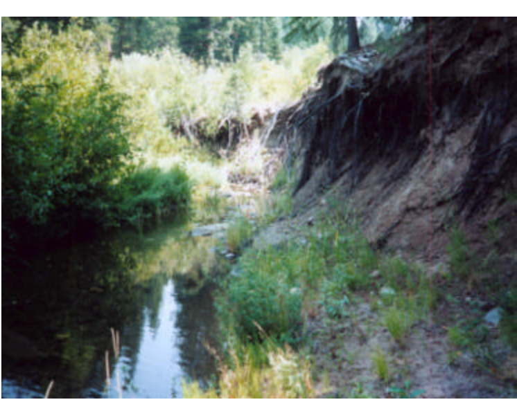
Degraded stream channel, incised into the meadow.

Also, because they are steep (greater than 4% gradients), most of the sediment delivered to them is quickly transported to lower gradient reaches. These lower gradient reaches are where most of the material eroded from the upland areas is deposited. Low gradient streams (less slope), formed in alluvium than 2% (sediment deposited by the action of streams) are generally located in the valley bottom. As explained above, streams in low gradient, alluvial reaches are sensitive to changes in climate, vegetation and land uses. Those channels already degraded are very sensitive changes to in watershed condition.