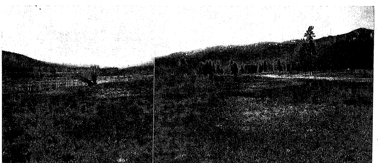
Up valley view with Sulphur Creek on the left.

This report documents the findings of an assessment of watershed condition. strategy for restoring Α and rehabilitating vital functions and stream channel conditions will be a separate document that will be finalized later this year. Some be considered treatments can restoration of full function, but the general strategy deals with rehabilitating the watershed while taking into account natural and human constraints, such as recreation, land developments, livestock grazing and other uses.