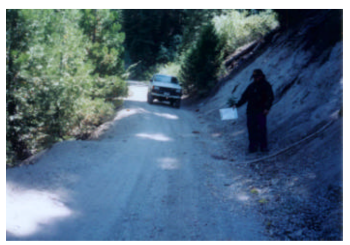
Cutbank and road surface eroding next to a stream channel.

Roads and Stream Crossings . The Sulphur Creek watershed road system was assessed because it is considered a primary contributor to the health of the watershed. Roads are known sources of stream sediment and are likely causes of increased streamflow peaks. Increased sediment and peak flows cause stream channel instability, as channels change their size, shape, and pattern.