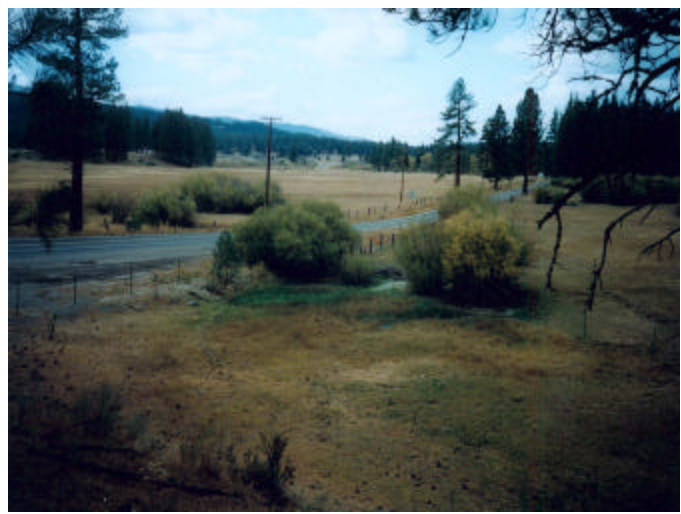
Looking downstream at the original confluence of Sulphur Creek and the Middle Fork Feather River.

The last major land-shaping event was the formation of the Frazier Creek Fan (actually a large debris flow deposit), which blocked the Middle Fork Feather River for several hundred years. The small lake that developed behind the debris dam extended up Sulphur Creek approximately 2 miles and was filled with gravel and finer sediment before the dam breached, an estimated 600 years ago (Durrell 1987). Most of the lake sediment has eroded away except for distinct terrace features just upstream from the existing mouth of Sulphur Creek. The large meadow area where the MFFR and Sulphur Creek once joined (across Highway 89 from the Clio bridge) is the eroded surface of the lake.