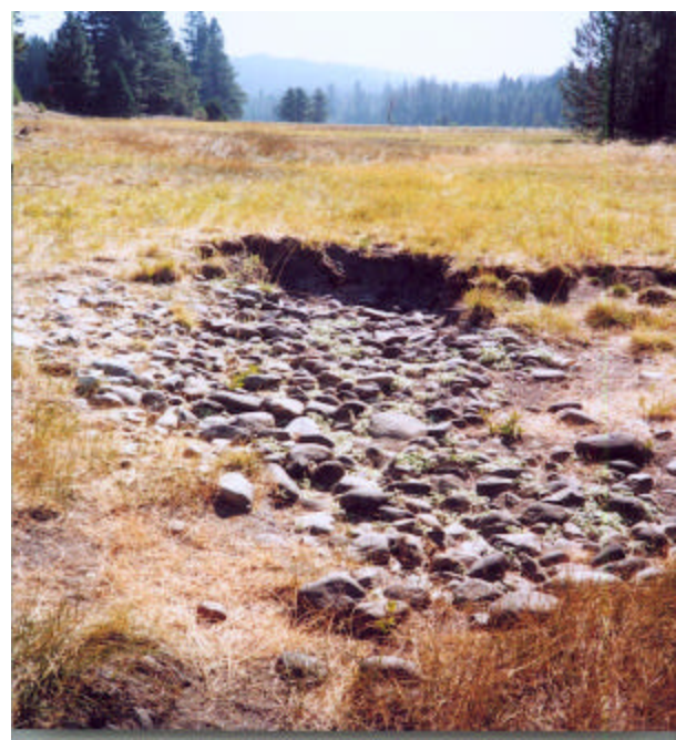
The entire length of Sulphur Creek, from McNair Meadow downstream to the

Middle Fork Feather River, was surveyed. The lower reaches of the tributary channels that flow through the main valley bottom were also surveyed. Cross-sections and longitudinal profile surveys were conducted along locations deemed representative of conditions of each stream reach.