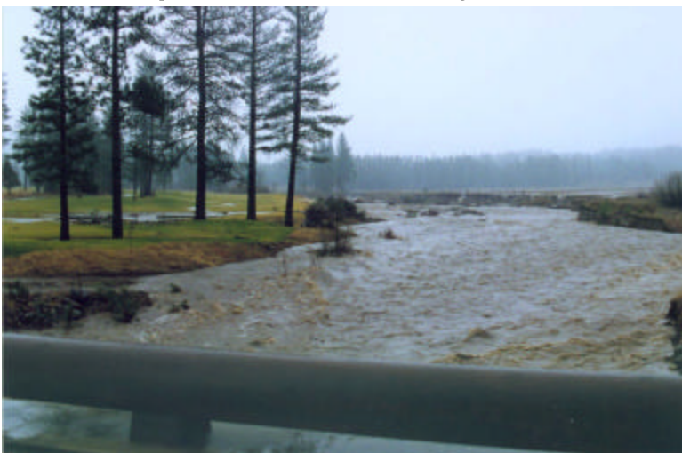
Sulphur Creek immediately after the flood.

Sulphur Creek at Whitehawk Bridge, Jan. 1997.