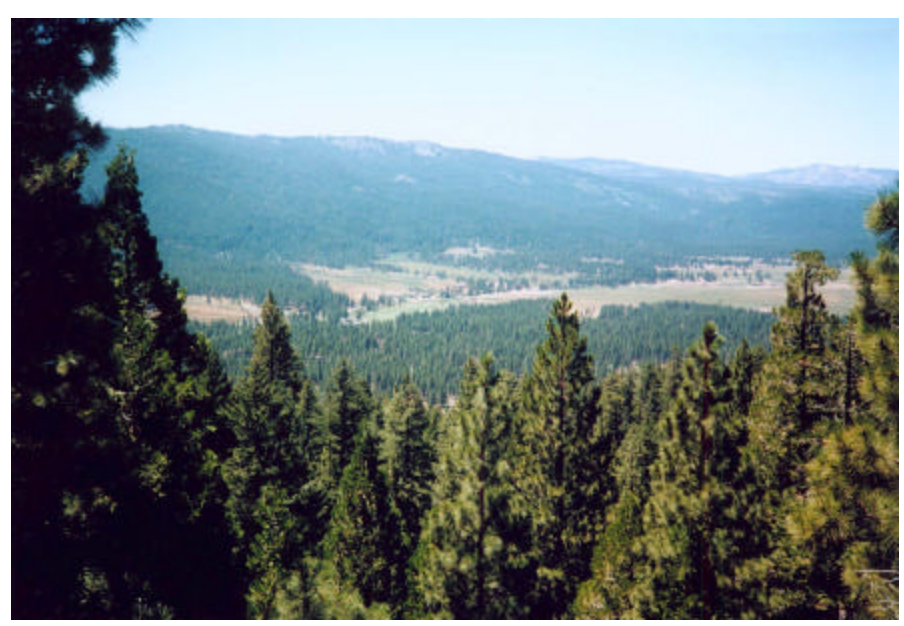
Figure 4 displays the major rock types in the watershed and subwatersheds. These rock types include meta-sedimentary. meta-volcanic with intruded granitics. The steep westside consists of granitic rock interspersed with glacial moraine and landslide material, while the eastside encompasses mostly volcanic mudflow material and some granitic rock. The vallev bottom consists of eroding lakebed (Mohawk Lake) and recent Alluvial fans have formed at alluvium. the mouths of the canyons, where tributary channels flow into the valley.

View across Sulphur Valley to west towards Mills Peak.