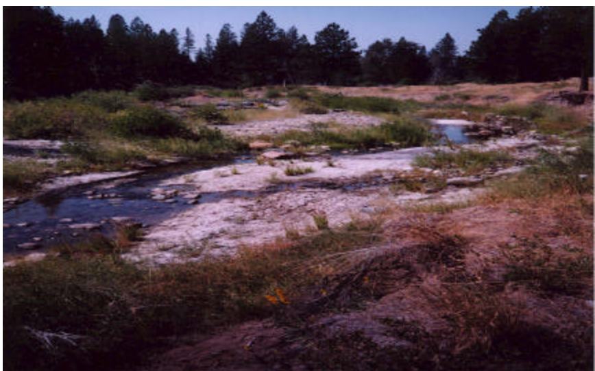
Sulphur Creek upstream of Whitehawk Ranch.

This degradation is in the form of reduced water quality, reduced aquatic and riparian habitats, property loss, and deteriorated aesthetic values. This analysis is not intended to evaluate timber harvesting, grazing, mining, and urban development practices; but it will evaluate the potential impacts of these practices where they still affect stream and riparian conditions. Other studies