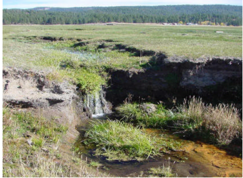
Headcut on Calfpasture Creek.