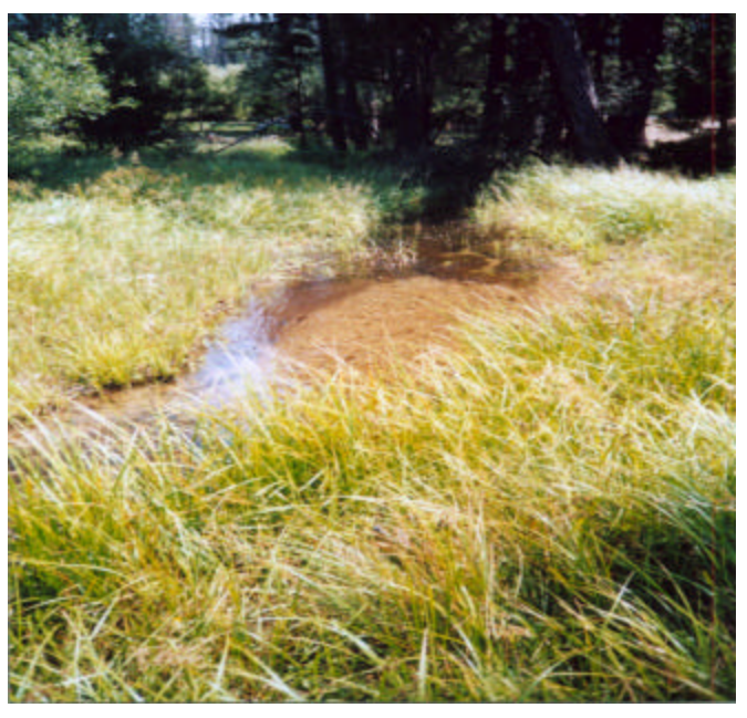
Low gradient stream formed in alluvial sediment in the valley bottom.

Degrading stream (gullving) channels eventually become entrenched and are unable to access their floodplains and contain most floods. They also transport more sediment downstream, where the response to changes in sediment supply is more sensitive than to changes in water supply. They respond to the added sediment supply by accelerating bank erosion and widening the gully.