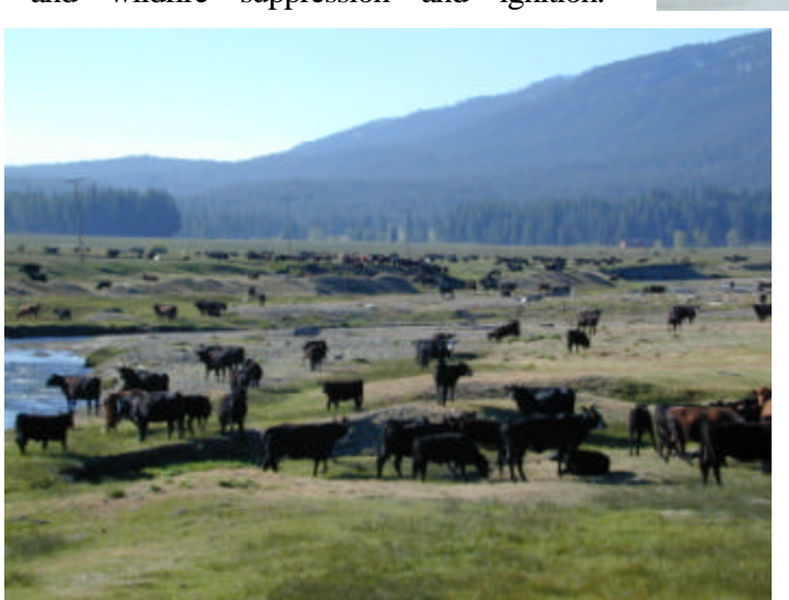
Pasture land and timberland.

Background. The Sulphur Creek watershed encompasses a significant portion of Mohawk Vallev and is formed by the main, north-south trending fault that defines the eastern edge of the Sierra-Nevada mountain range. The watershed has experienced nearly 150 years of land and resource use. These uses included mining, timber harvesting, livestock grazing, road construction, water diversions, channel straightening and realignment, urban developments, and wildfire suppression and ignition.