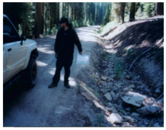
Road erosion and stream delivery survey.

Subcontracts were let to gather historic information and to conduct a reconnaissance level geomorphic study (designed to identify both natural and human caused disturbances). A seasonal crew of two people conducted surveys of the road system while FR-CRM staff conducted stream channel surveys.