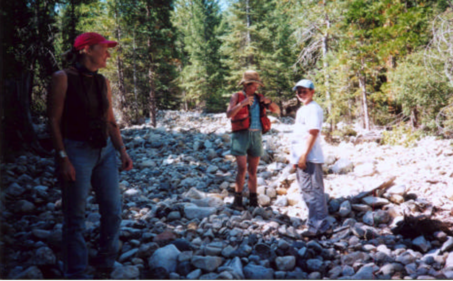
Debris flow deposit entering Sulphur Creek.

debris and coarse bedload naturally transported by the tributary channels to the vallev was captured and stored, creating alluvial fans. while the finer suspended sediments washed out onto the meadow and deposited as alluvial overbank deposits (Durrell 1987 & Collins 2002).