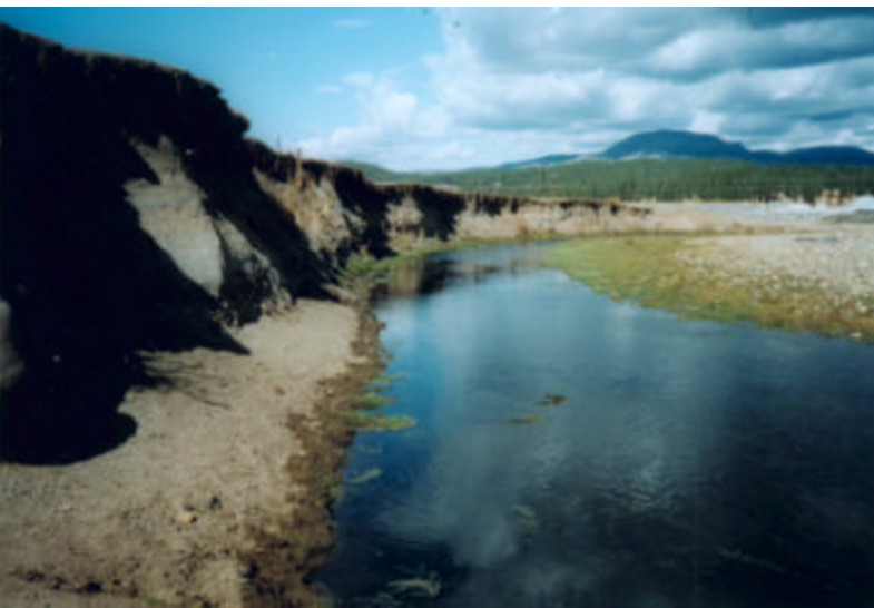
Channel bank composed of highly erodible silts opposite a less erodible gravel bar.

As stated in the introduction, this study concentrated on the two watershed elements that are considered to be the most responsible for the obvious changes in watershed health: (1) Stream