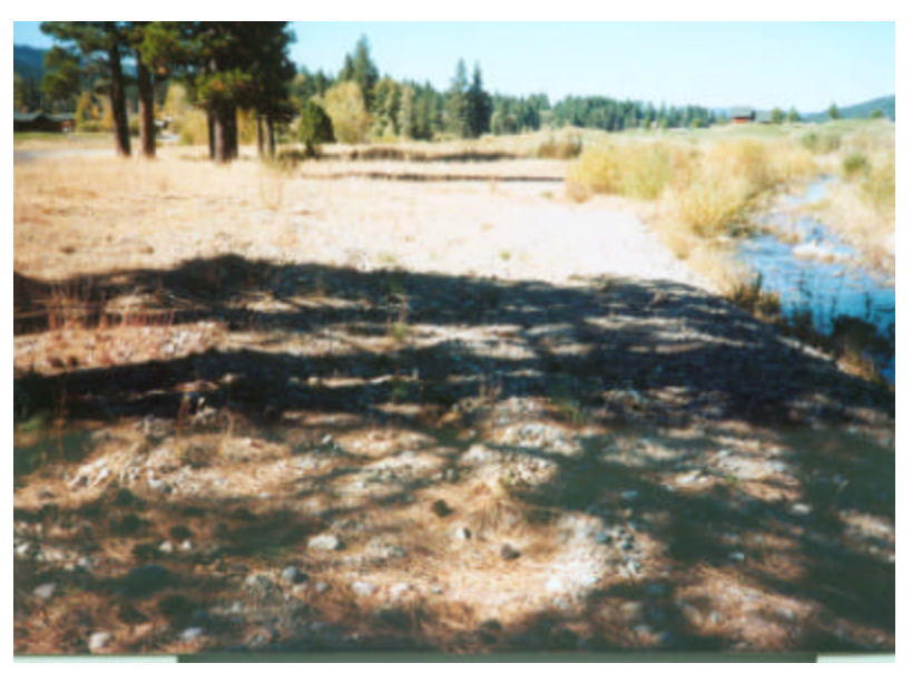
Floodplain reduced in size by soil fill.

Channel Filling. The main channel of Sulphur Creek has become entrenched and is in the process of widening at its elevation reestablish new to its floodplain. Until the appropriate width is obtained, the channel will continue to be unstable. Sulphur Creek is becoming less of a gully and more of an entrenched channel with an inner floodplain within the Whitehawk Ranch channel reach. Artificial fill placed on the evolving floodplain reduces its width and effectiveness. Streamflow depths and (erosion shear stresses forces) are increased at those locations and both upstream and downstream of the sites.