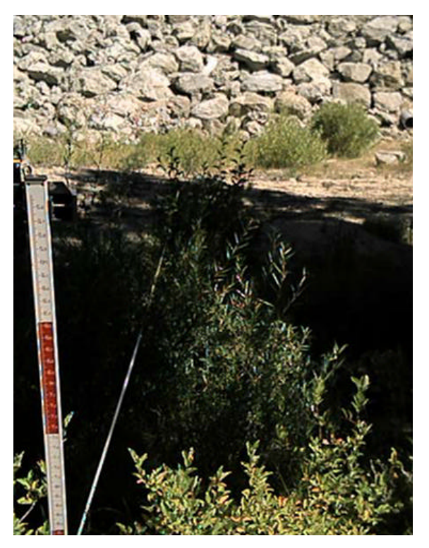
Channel cross-section survey.