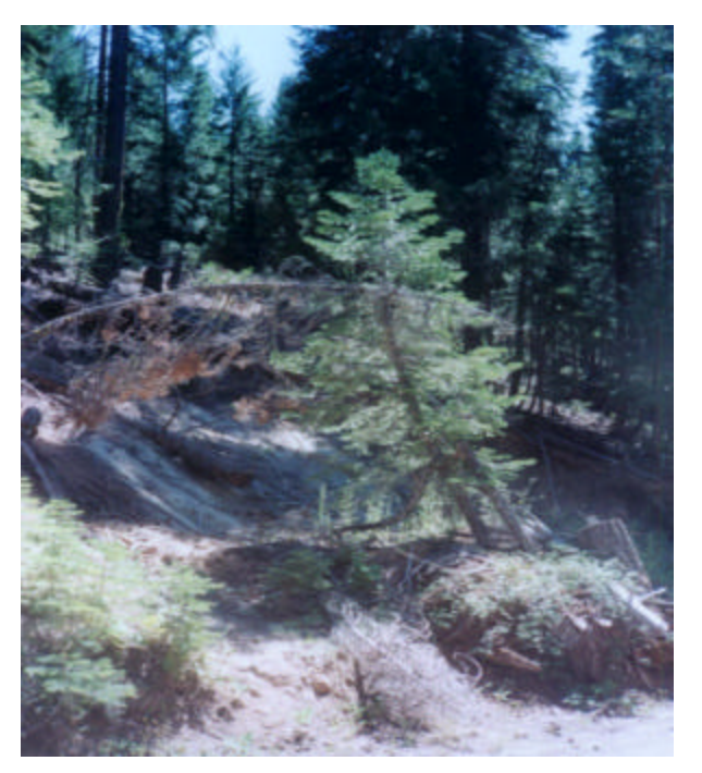
Small land slump.

Geologic Hazards. The eastern portion of watershed contains few landslide mass wasting features. They are mostly associated with channel "inner gorges" (over-steepened slopes adjacent to stream channels). The westside is a steep, fault scarp where slumps and landslides are common. Significant amounts of coarse material are delivered and stored in headwater stream channels, creating large debris flows that