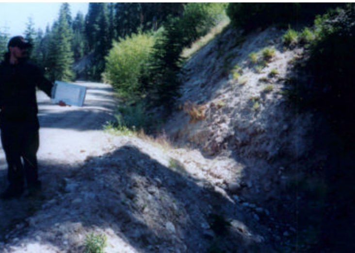
Inside ditch draining directly to a stream.

Large amounts of gravel are moving from upstream channel reaches into the main valley bottom channel, forming large in-channel features, including point-bars and mid-channel islands. These features in turn further accelerate bank erosion. The finer sediment (silts