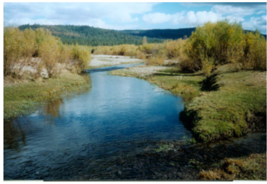
Lower Sulphur Creek developing an inset channel and floodplain. Fresh gravel upstream.

<u>Bankfull flow</u> occurs approximately ______ every one to two years.