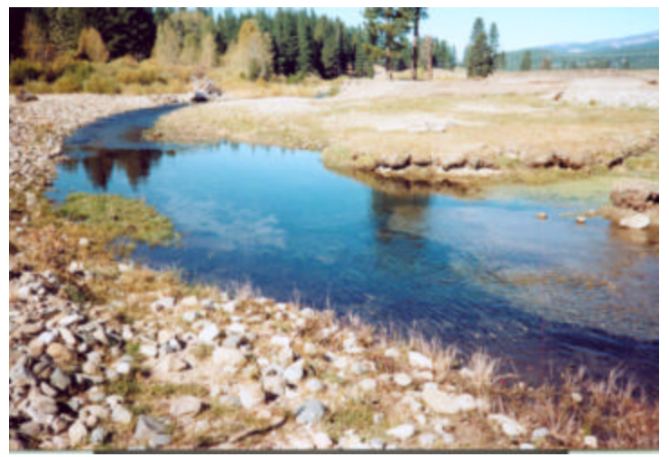
Middle reach of Sulphur Creek

In the Sulphur Creek watershed, summer air temperatures can reach 100°F during